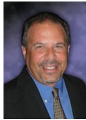
3 President's Message