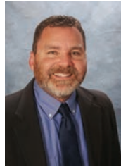
4 Secretary-Treasurer's Report