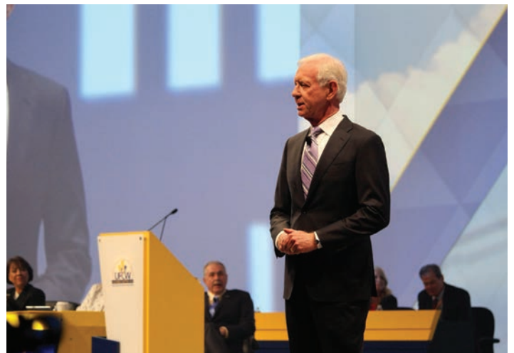
Chesley B. "Sully" Sullenberger, III has been dedicated to the pursuit of safety for his entire adult life. While he is best known for landing a commercial jetliner on the Hudson River, he is a union man who currently serves on the U.S. Department of Transportation's Advisory Committee for Automation in Transportation.