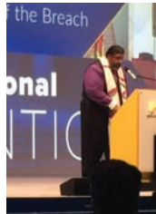
10 Reverend William Barber