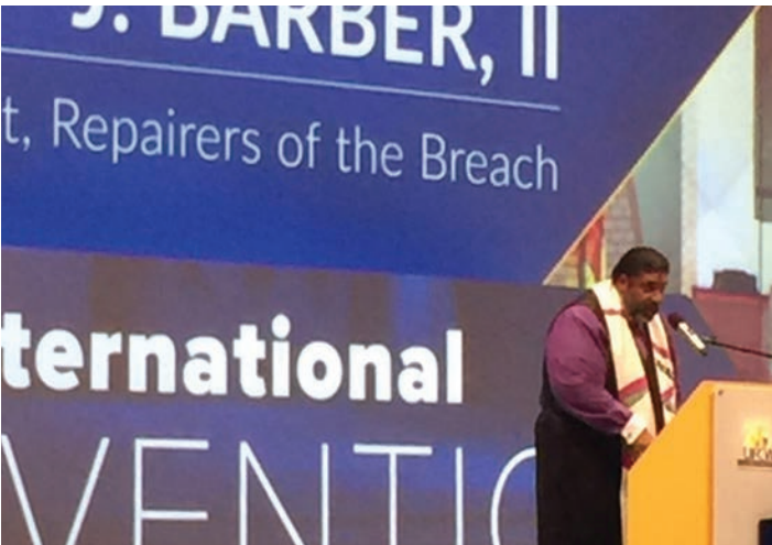
Reverend William J. Barber, is president of Repairers of the Breach, national co-chair of the 2018 Poor People's Campaign, and leads an alliance of more than 200 progressive organizations best known as Moral Monday. Moral Monday is a multi-racial, multi-faith movement fighting for voting rights, public education, universal health care, environmental protection, women's rights, labor, immigrants and member of the LGBTQ community. (More about Barber on Page 10.)