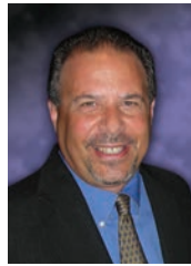
3 President's Report