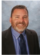
4 Executive Assistant's Report