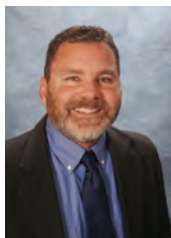
4 Secretary- Treasurer's Report