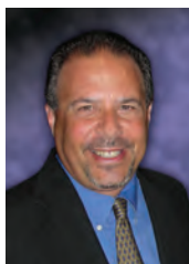
3 President's Report