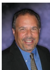
3 President's Report