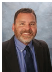
4 Executive Assistant's Report